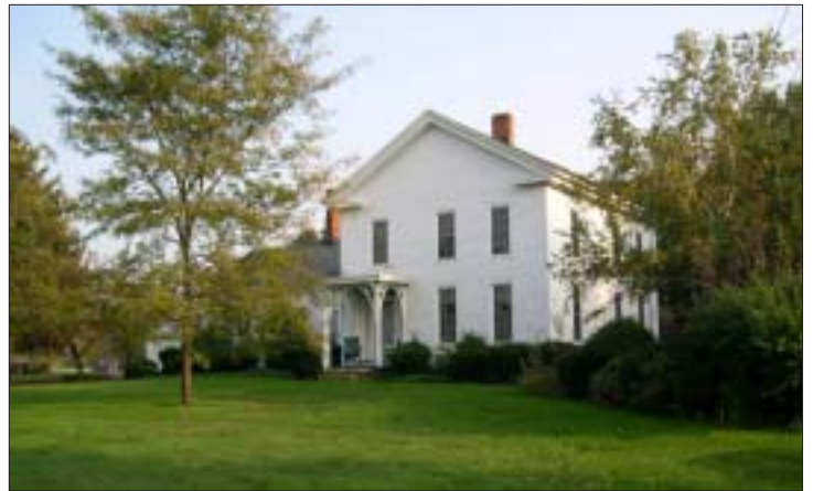
Joseph Townshend House (c1855).