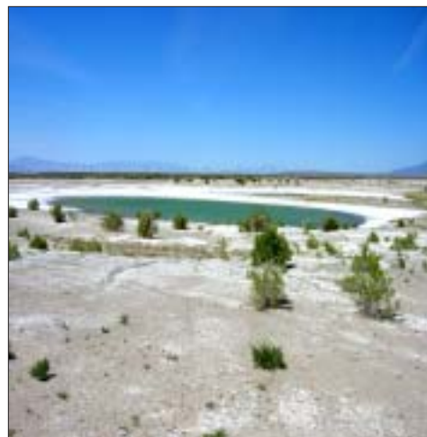
Alkali lakes in the Black Rock Desert, Nevada (May 2007).