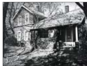
October—The Traxler House (built ~1830s) at 3864 Colorado Avenue