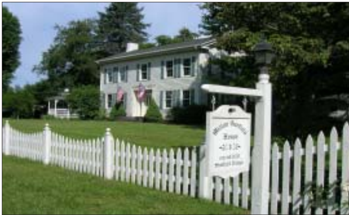
Milton Garfield House (1839).