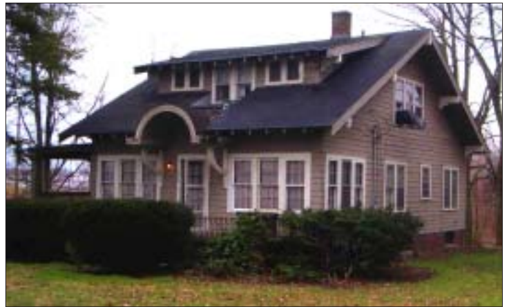
Clyde McAllister House (c1925).