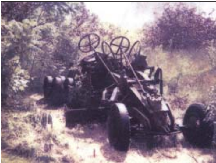
Sheffield Village's first road grader (fabricated 1928) in disrepair at Caley Farm before restoration (courtesy of Frank Root, Jr.).