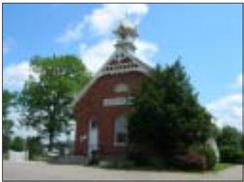
The Village Hall Status: Extant (owned by Village of Sheffield)