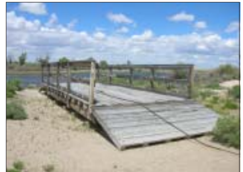
Replica of a Mormon Ferry on the Green River, Wyoming (May 2007).

On June 29 the company crossed the continental divide at South Pass and encountered a snow bank 16 feet deep. The rocks here looked like pieces of broken glass [volcanic obsidian]. Brooks surmised it was "made in nature's laboratory and thrown out here ages ago." He described the terrain here as "Tablelands—about 6000 feet above sea level and bounded by snow-capped mountains." South Pass has an actual elevation of 7,550 feet. At the Green River the company crossed on another ferry operated by the Mormons, paying $5 for each wagon. Garfield commented "at 50 to 75 wagons a day, the Mormons are fast making up for what they lost in Missouri and Illinois," referring to murder and expulsion of Mormons from these states in the 1830s and 1840s.