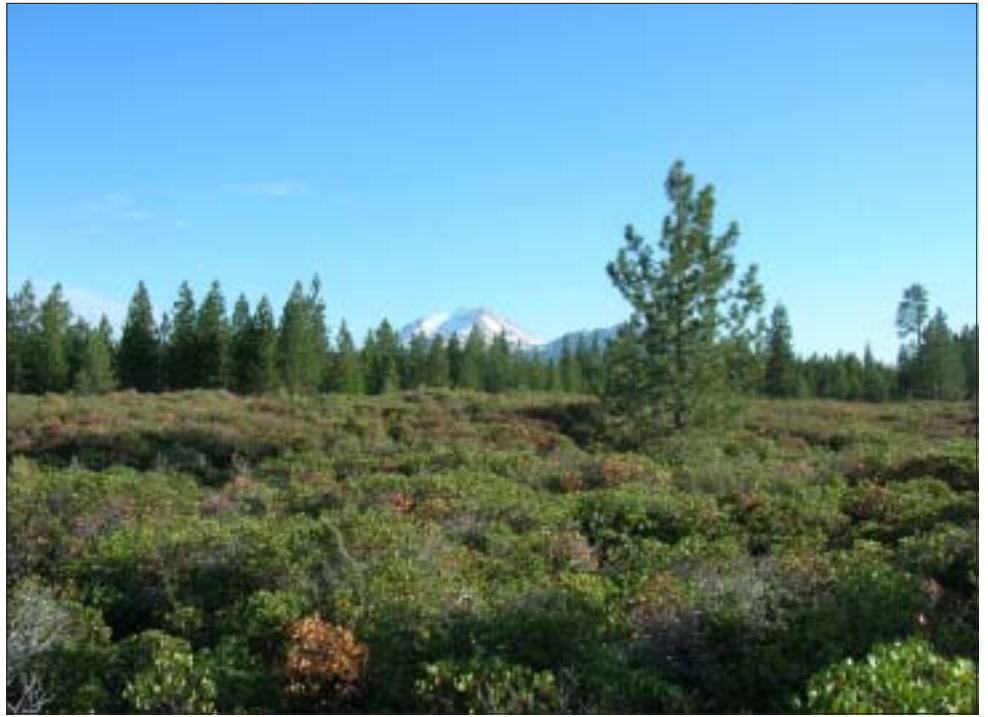
Mt. Shasta from the Sacramento River Valley, California (June 2007).