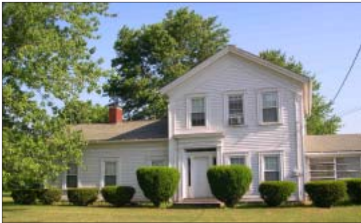
Halsey Garfield House (1854).

By early fall the Historical Society plans to have completed work on a draft ordinance to submit to the Village Council for consideration. The ordinance will contain guidelines for developers to assist them in selecting appropriate exterior designs to compliment and enhance the visual character of North Ridge. The guidelines will draw on the existing historic styles of the corridor. As the planning process proceeds, the Historical Society and the Village welcomes suggestions and comments to keep our Village an attractive place to live, work, shop, and do business.