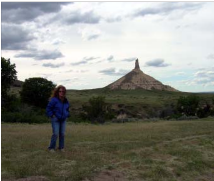
Chimney Rock, Nebraska (May 2007).