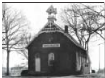
January—The Village Hall (built 1883) at 4820 Detroit Road

Here are the buildings as featured in the 1977 calendar: