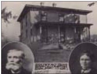
The William Day House in 1870s Status: Extant (private ownership, descendants of Day Family)