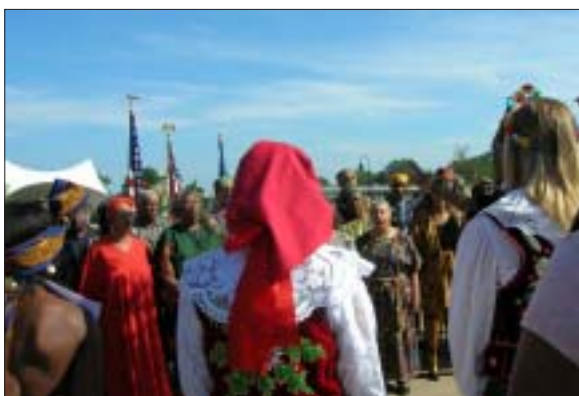
The Ecumenical Disciplines of Cleveland singers and the Lorain International Festival Princesses.