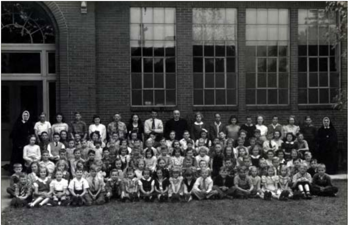
Faculty and students at St. Teresa School in 1947.