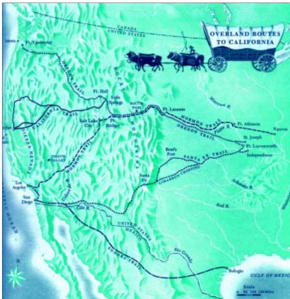
Historic overland trails to California.