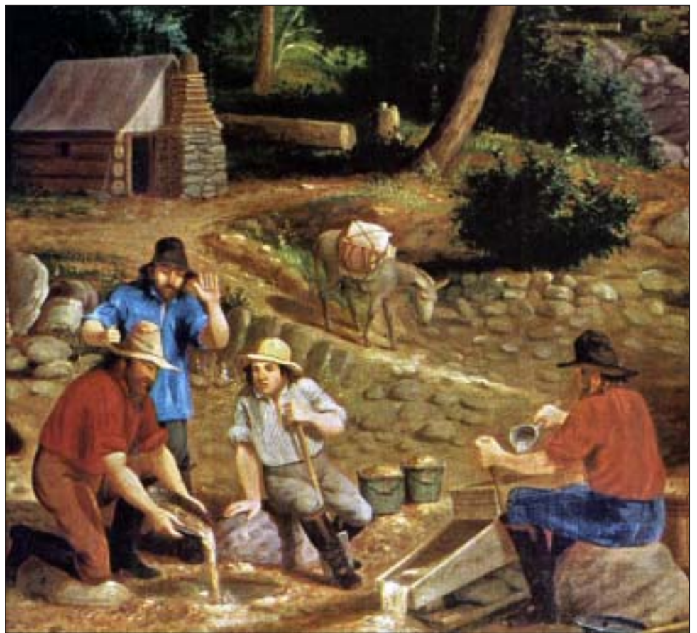
Forty-niner's gold camp on the Feather River, California.