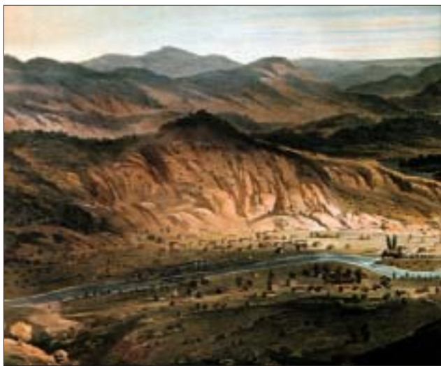
Coloma on the South Fork of the American River, California where gold was discovered at Sutter’s Mill in 1848.

spring up as if by magic, merely to waste their sweetness on the desert air. Yellow seems to be nature’s favorite color here, although she puts on all the hues of the rainbow, and more too. I mean, of course, in the way of flowers, for no country can be greener, as almost all trees and shrubs are evergreens. Flowers began to bloom here about the first of February. I expect to see some rare displays of flowery beauty while traveling up the valley of the Sacramento, which will be my road to Trinity.”