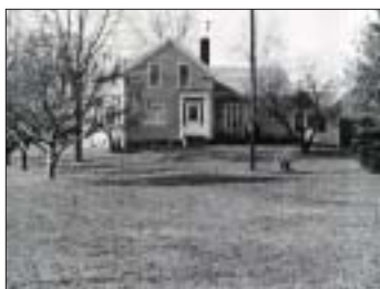
August—The Schueller House (built ~1870s) at 1148 Abbe Road