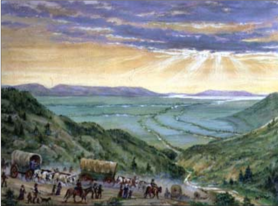
Forty-niners entering the Great Salt Lake Basin (courtesy of the National Park Service).

of the wagons and crossing 48 creeks of different sizes in the afternoon. Garfield prepared the following description of the city and its Mormon population: