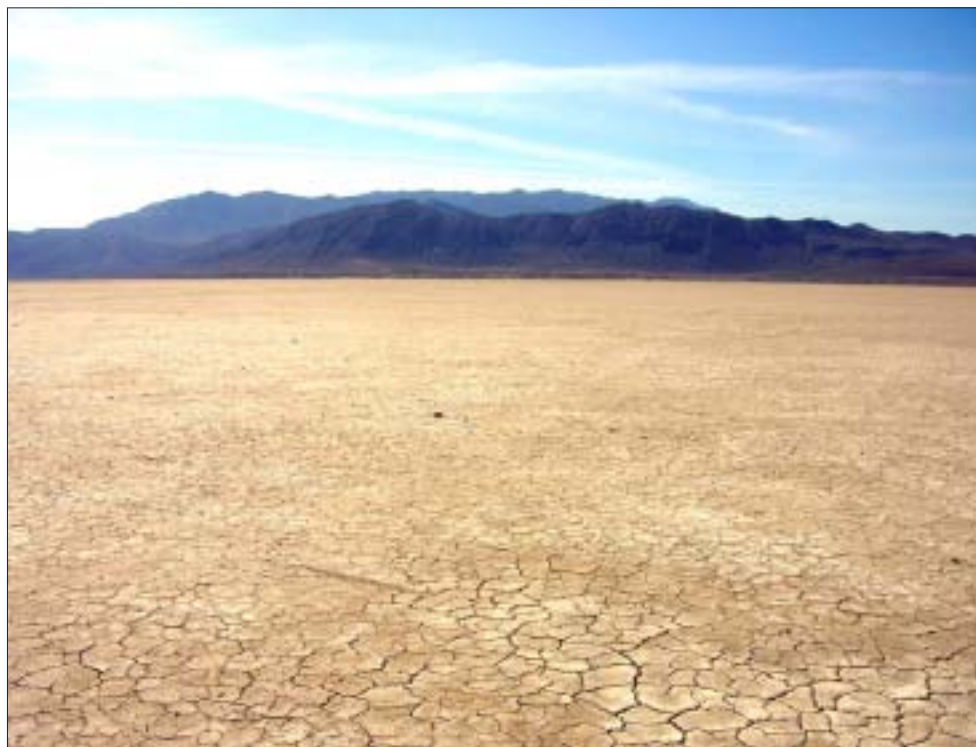
Black Rock Desert, Nevada (May 2007).