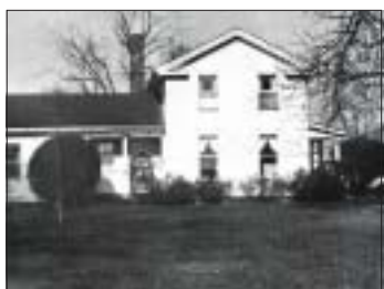
March—The Douglas Smith House (built 1833) at 4759 Detroit Road