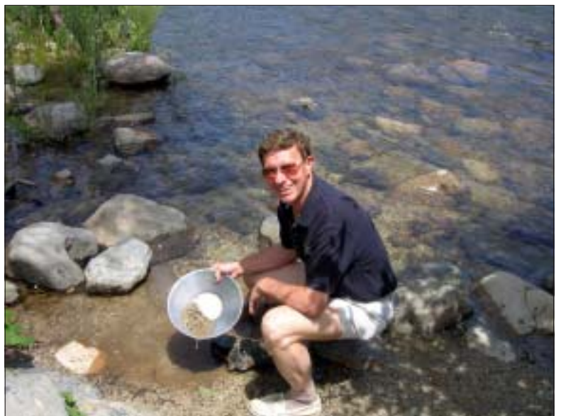
Panning for gold at Coloma on the American River, California (June 2007).