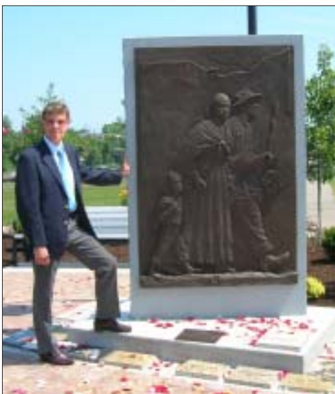
The Promised Land statue.