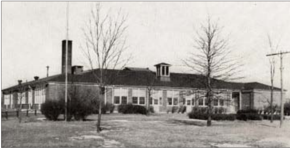
Brookside School constructed in 1923.