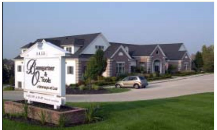
Village Reserve, Phase I (2001).