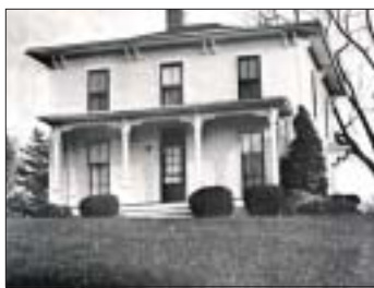
June—The William Day House (built 1879) at 2837 East River Road