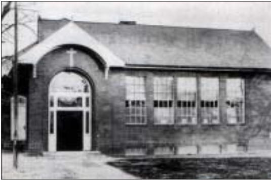
District No. 7 Schoolhouse converted to St. Teresa School (c1927).

In August 1987 St. Teresa School was finally razed to make way for a parking lot, despite the hopes of many former students that the building be retained.