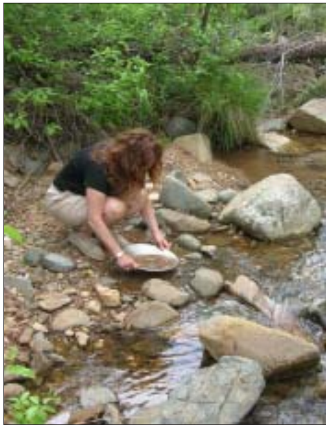
Panning for gold on the Feather River, California (June 2007).