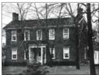
February—The Jabez Burrell House (built 1825) at 2792 East River Road