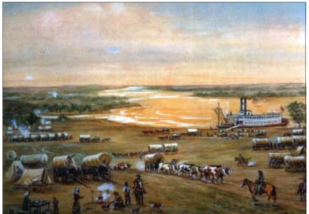
Forty-niners disembarking a river steamer at St. Joseph, Missouri.

At St. Joseph they purchased oxen for their wagons, but soon discovered that the prairie