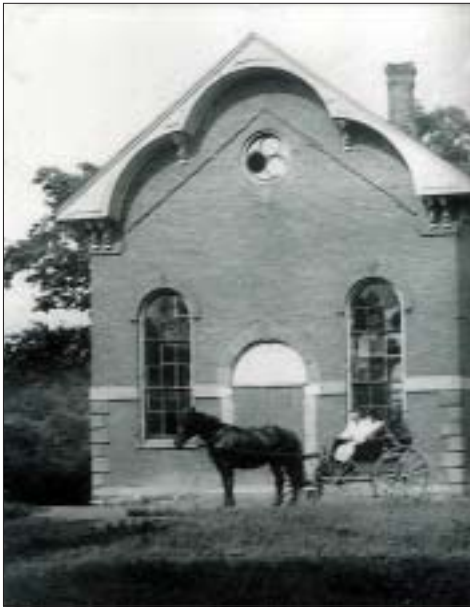
District No. 1 Schoolhouse on East River Road.