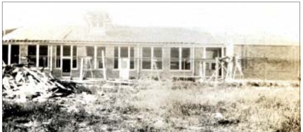
Tornado damage to new Brookside School on June 28, 1924.

In repairing the tornado damage, two more classrooms and a manual training room were added. New equipment included a radio with a loud speaker in each classroom, an orthophonic, and electric tools for manual training. The repairs were completed in time to welcome grades 1 through 8 to the new school in September. Three buses, installed with heaters and ventilators, were used to transport students living more than a mile from the school. High school aged students from the Village continued to attend classes in Elyria or Lorain until 1929 when a Senior High School was organized. On December 16 of that year the State Department of Education issued a Class "A" high school charter to Brookside and the first senior class graduated in May 1930. Brookside had 220 students that year, 60 of which were in high school. The eight graduating seniors included: Carl Bacher, Walter Day, Alicebelle Drompp, Charles Gubeno, Philip Hladik, Wayne Inslee, Kenneth McAllister, and Ruth Root. James A. McConihe was principal and members of the school board were Mrs. H. Burrell, Mrs. F. Field, H. Gang, Henry G. Root, and J. Townsend. The Leader yearbook was also initiated in 1930 and has been published by the Senior Classes each year