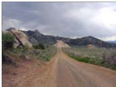
City of Rocks, Idaho (May 2007).

much of it gold dust in papers marked with their value. They are also coining gold here. The pieces are plain with the words ten dollars stamped on them. The gold which we see here is in lumps from the size of a kernel of wheat or smaller up to the size of acorns of four or five dollars. Those that have returned from the mines say the average yield in the dry diggings is not less than fifty dollars a day and from that to one and two hundred and a Mormon that I saw at Green River got even hundred and fifty a day."