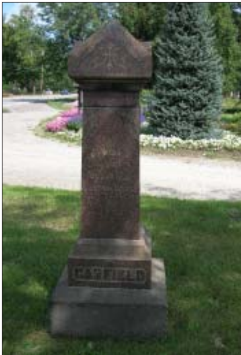
Henry Garfield's grave at Garfield Cemetery.