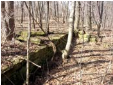
Foundation of District No. 1 Schoolhouse (2007).

Another one-room school building was located on North Ridge in the 1870s according to an 1874 map of Sheffield Township. This presumably wood frame structure was replaced in 1883 with the red brick building that now serves as the Sheffield Village Hall, housing the Village Treasurer's