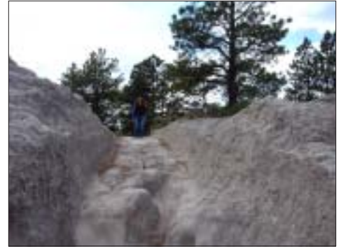
Wagon ruts on the California Trail still visible near Fort Laramie, Wyoming (May 2007).

On June 24, the company passed through rugged Devil's Gate, southwest of present day Casper, Wyoming. This is a spectacular, narrow gorge where the Sweetwater River, a headwater stream of the Platte River, rushes past rocky walls several hundred feet high. For the next several days the company passed through terrain dotted with alkali lakes, some of which had dried up leaving a white crust of saleratus (sodium bicarbonate) on the ground. Brooks noted that "This alkaline water has killed a few cattle for other companies but we have not lost any. When an ox has been drinking saleratus water there