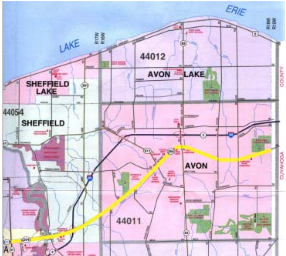
North Ridge Scenic Byway shown in yellow (map courtesy of Ken Carney, Lorain County Engineer).

The 175-page, full-color proposal to establish the North Ridge Scenic Byway was prepared by the Sheffield Village Historical Society & Cultural Center and the Avon Historical Society and was submitted to the Ohio Department of Transportation in December 2005. The proposal was endorsed by the mayor's of Sheffield Village and Avon and by the trustees of Sheffield Township. The Lorain County Board of Commissioners, Lorain County Engineer's Office, Lorain County Historical Society, Lorain County Metro Parks, Lorain County Visitors Bureau, and several area citizens contributed materials and letters of support.