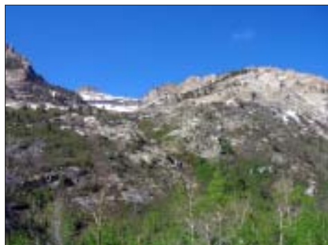
Ruby Mountains in the Basin and Range Region of Nevada (May 2007).