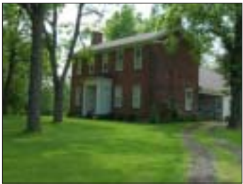
The Jabez Burrell House Status: Extant (owned by Lorain County Metro Parks)