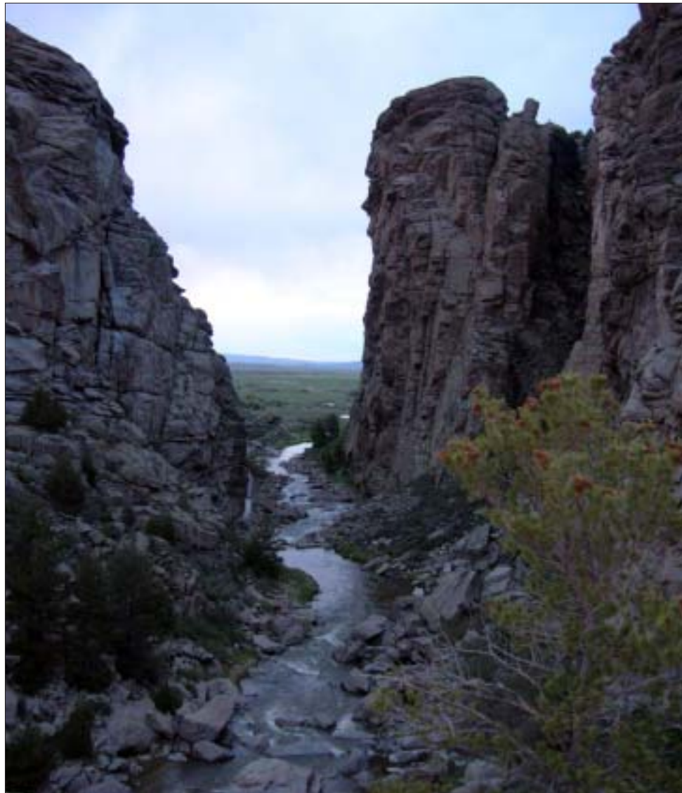
Devil's Gate, Wyoming (May 2007).

On July 5 the company passed Fort Bridger in southwest Wyoming and arrived at Salt Lake City on the evening of July 14, tired and footsore after repairing an axletree on one