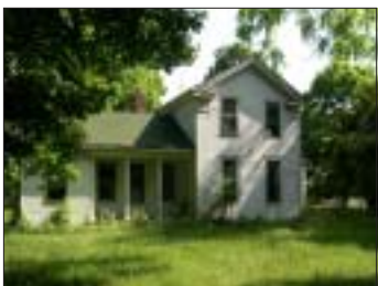
The Douglas Smith House Status: Extant (private ownership)