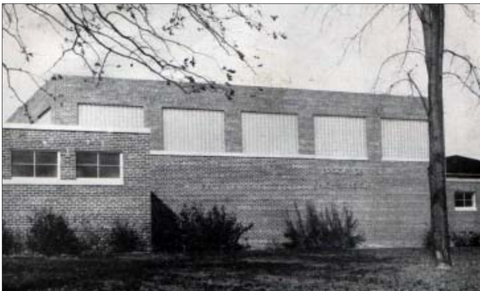
Brookside High School's gymnasium wing constructed in 1955.

since then except 1935 when the Great Depression caused it to be cancelled.