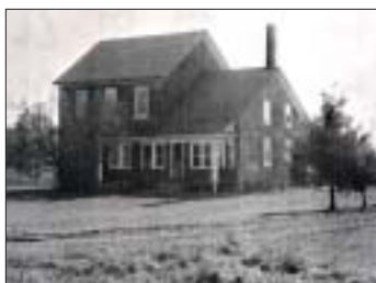
May—The Fitch House (built ~1830s) at 4014 Old Colorado Avenue