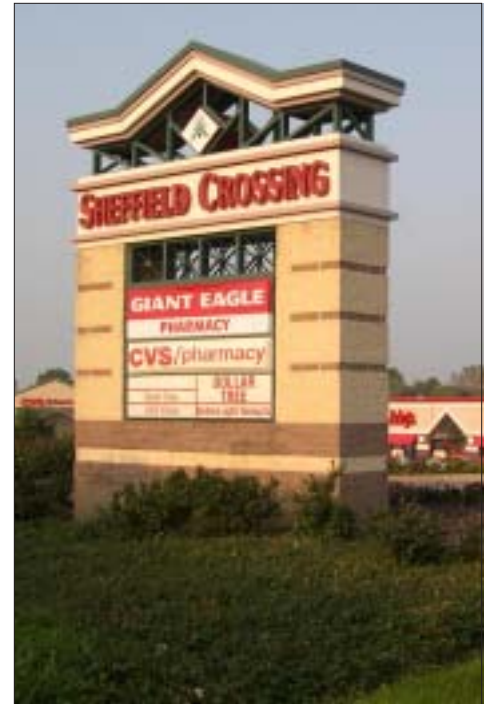
Commercial Occupancy Permits Issued by Sheffield Village