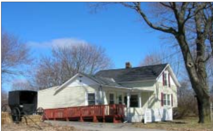
Ye Olde Village Kountry Store [Minard House (c1870)].