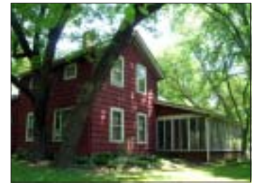
The Traxler House Status: Extant (private ownership, descendants of Traxler Family)