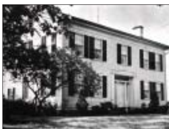
July—The Milton Garfield House (built 1839) at 4921 Detroit Road