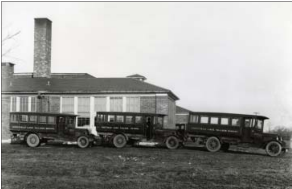
Brookside School's first school buses c1925 (courtesy of The Leader).