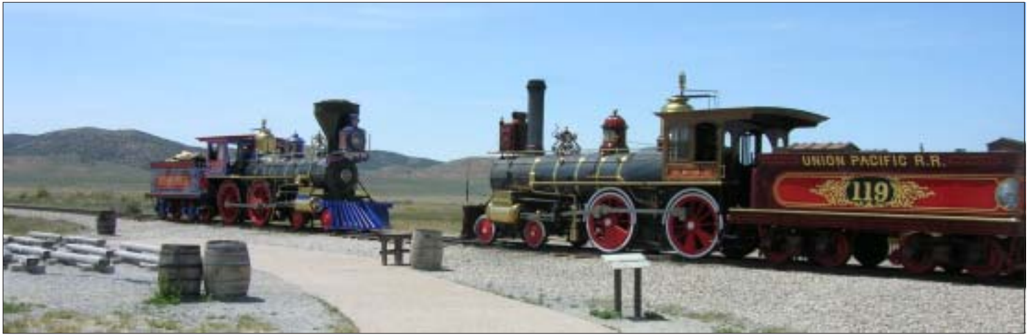
Transcontinental Railroad meeting place at Promontory Point, Utah (May 2007).