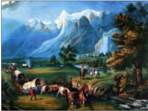
Forty-niners crossing the Sierra Nevada Mountains.

The company reached the Sierra Nevada Mountains on August 31, zigzagged up to the summit of Fandango Pass, and then down the west slope to Goose Lake on the California/Oregon border. At times two or three teams were put together to pull the wagons up the steep slopes by moonlight. On the down slopes the wheels were chained, but some broke away and the cattle were forced to trot for one and a half miles as the wagons pushed them forward. From here the company followed the Lassen Trail down the Pitt River, noting many beaver dams along this stream.