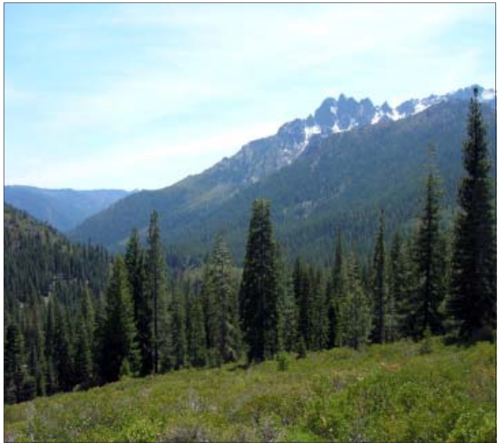
Sierra Nevada Mountains near Fandango Pass, California (May 2007).

On September 13 the company camped at Silver Lake, believed to be the headwaters of the Feather River, noting that the stream was full of trout. On September 22, 1849, six months after they boarded the steamer on the Ohio River, Buckeye Company reached Peter Lassen's Ranch in the Sacramento River valley. Their long journey had ended and the company dispersed.