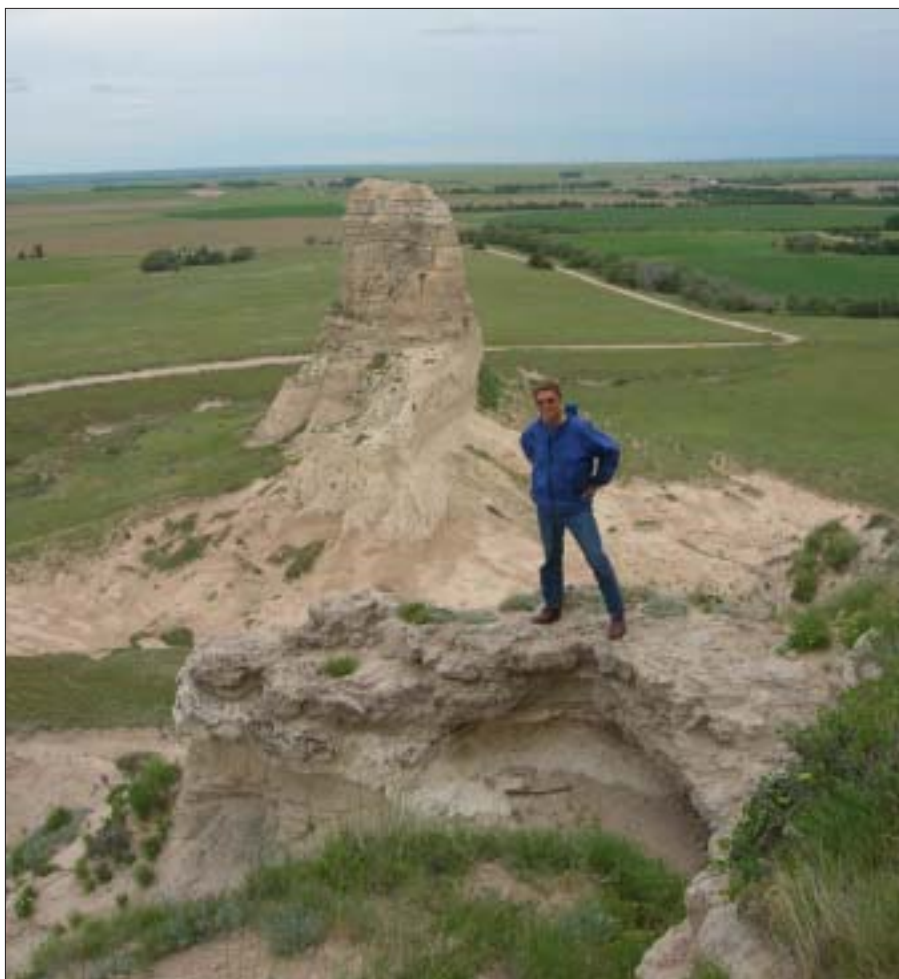
Climbing Courthouse & Jail Rock, Nebraska (May 2007).