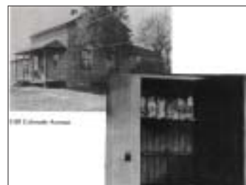
December—The Crandal Post Office (built ~1850s) at 5120 Colorado Avenue