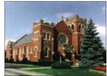
Saint Teresa Church Status: Extant (owned by Catholic Diocese of Cleveland)