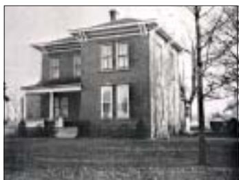
April—The Gubeno-Gornall House (built 1855) at 5220 Detroit Road