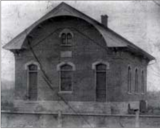
District No. 7 Schoolhouse on Abbe Road (c1895).