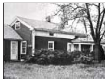
November—The James Day House (built 1850) at 4530 Colorado Avenue