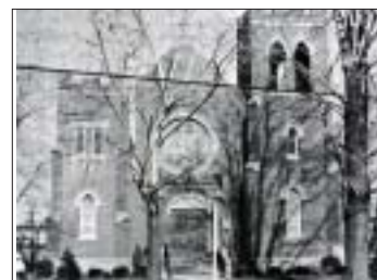
September—Saint Teresa Church (built 1907) Colorado Avenue at Abbe Road